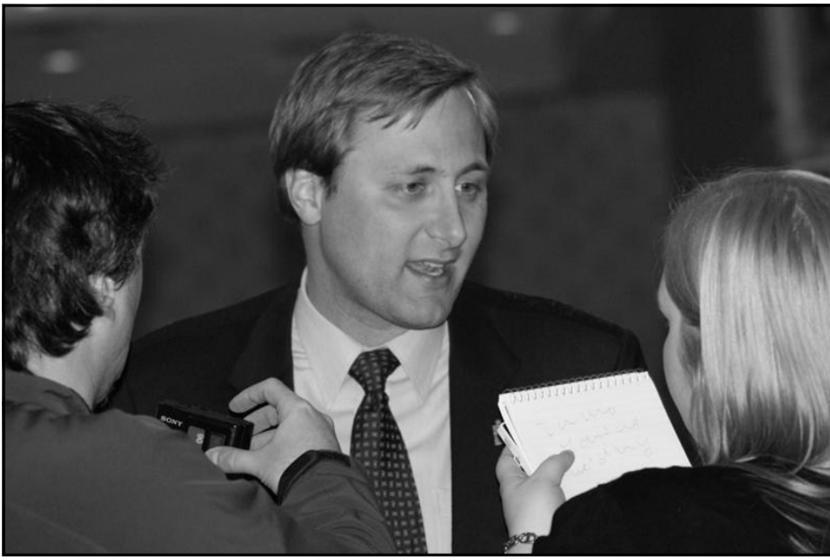
MP Brad Trost talks to reporters (above) and shares a laugh with a supporter (right) on election night at the Hilton Garden Inn in Saskatoon on Monday, May 2nd.